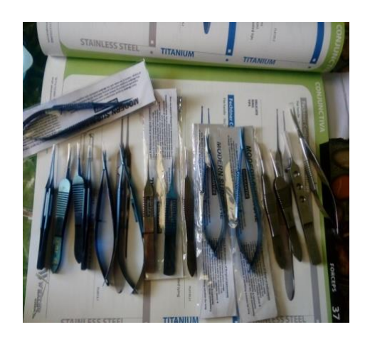
Buy more eye operation instruments