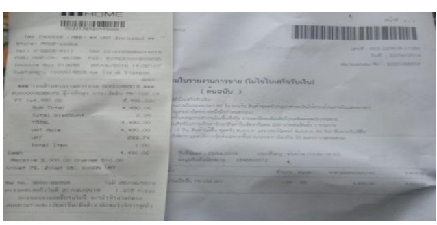
Buy equipment received paper